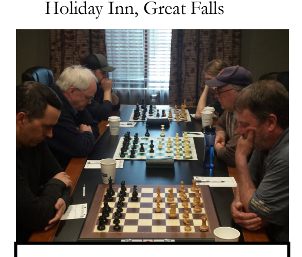
Will you make the top 6 and the 2020 Montana Closed?